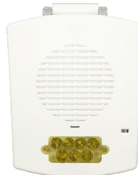
Horn-Strobe with Amber Lens