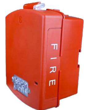
Strobe with 'FIRE' Letter Plate