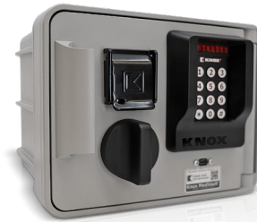
MedVault 2.75 Mini Surface Mount