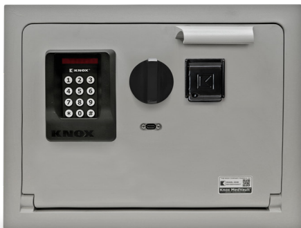
MedVault 2.75 Recessed Mount