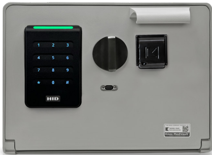
MedVault 2.75 Surface Mount with Badge Reader

The Knox MedVault 2.75 and MedVault Mini offer secure narcotics storage in first responder vehicle applications. Devices automatically collect access events and upload them to the KnoxConnect ® Software Management System for review. When used with KnoxConnect Notifications or integrated with inventory systems, MedVault 2.75 can strengthen the drug chain of custody tracking and reporting. Access methods include PIN entry, override key and now available for use with credentials such as badges, fobs and mobile credentials.