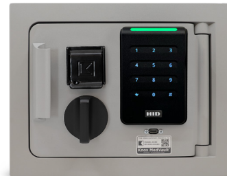
MedVault 2.75 Mini Recessed Mount with Badge Reader