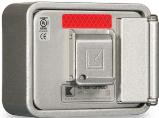
Surface Mount Model #1662