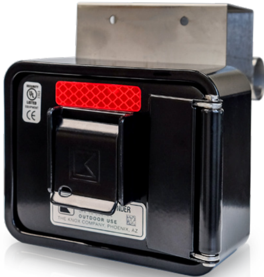
Door Hanger Model #1659