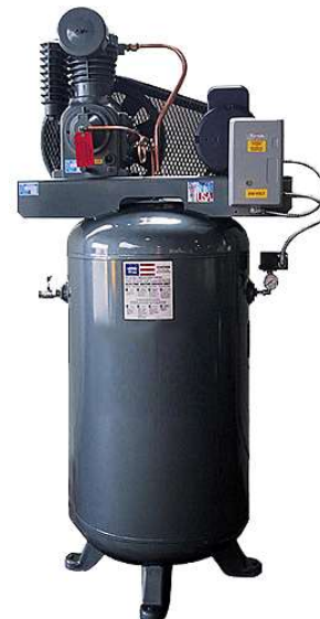
FIGURE 1 NITROGEN-PAC™ Model CTA Compressor Tank Assembly (Vertical Configuration Shown)

The Model CTA assembly can provide air for 30-minute fill of dry-pipe and preaction sprinkler piping per NFPA 13, and can supply air to the inlet of a NITROGEN-PAC™ M Series Nitrogen Generator Module for production of nitrogen. See Table 1 for compressor capacities. Refer to UNITED Fire Systems manual P/N 30-NPMICM-001 for detailed information on choosing the proper assembly.