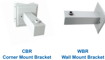
CBR Corner Mount Bracket